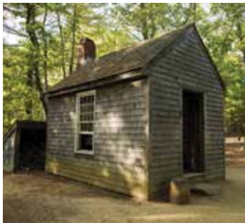
Replica of Thoreau’s Walden cabin