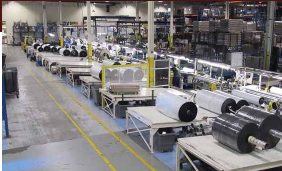
Haartz Quality Assurance operations

As product requirements and challenges mounted, Haartz was easily able to assimilate Mahlo scanners into their other lines, measuring total weight, then film weight and laser thickness on the substrate, followed by full Auto Profile Control of the film weight. “The Mahlo APC gets up to production speed fast. Less material is wasted and uptime maximized,” Gilbert noted. “Our crews and engineers were all in favor of the change.”