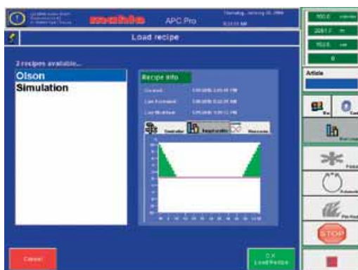
Recipe settings for die control